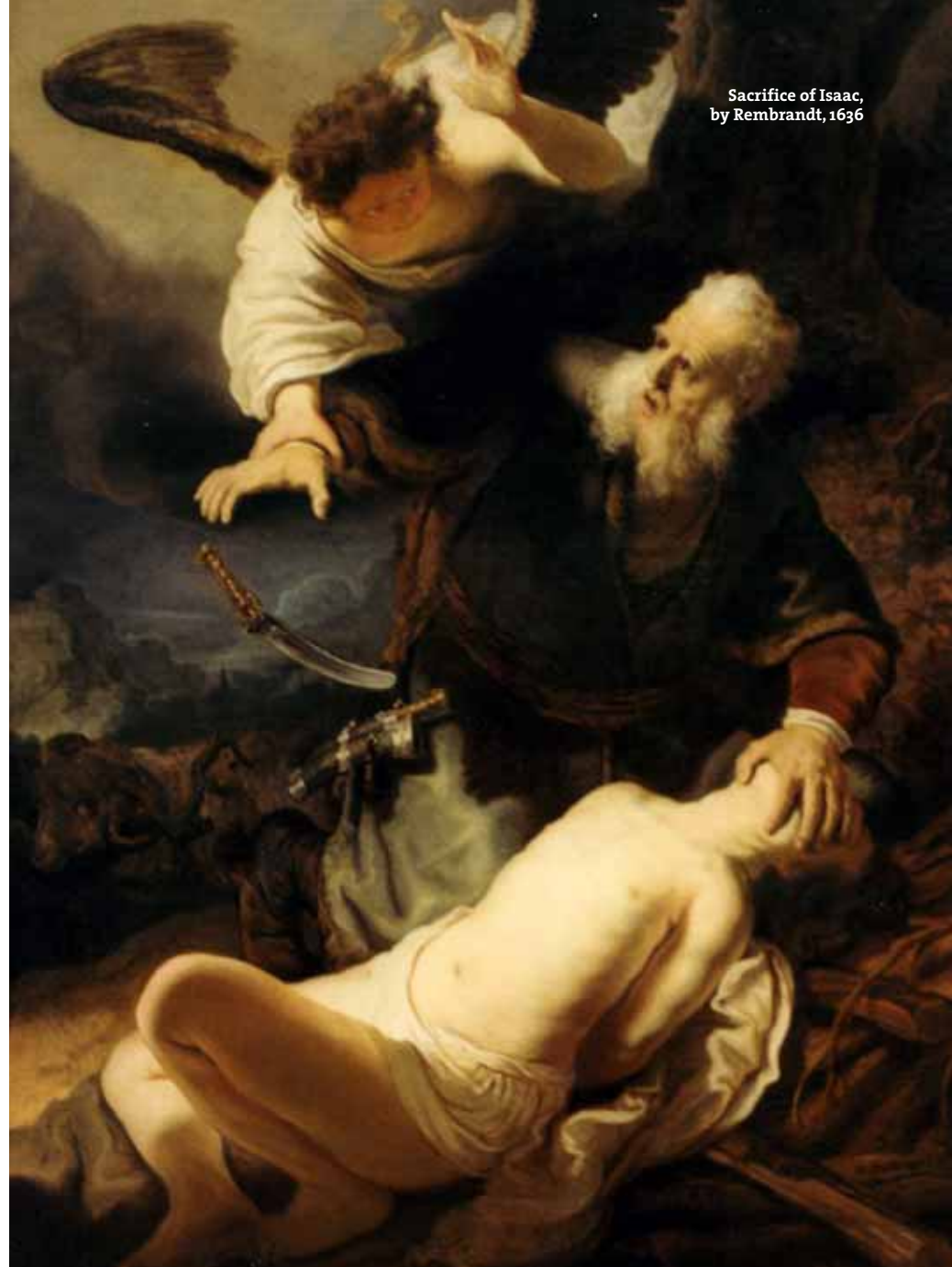
Sacrifice of Isaac, by Rembrandt, 1636

After all, God had already promised that Abraham's descendants would come from Isaac (Genesis 21:12), and if Isaac were to die, God's covenantal promise could not be fulfilled. Why, Abraham thought, would he sacrifice his son to such a deity? If, as this nonstandard reading of the