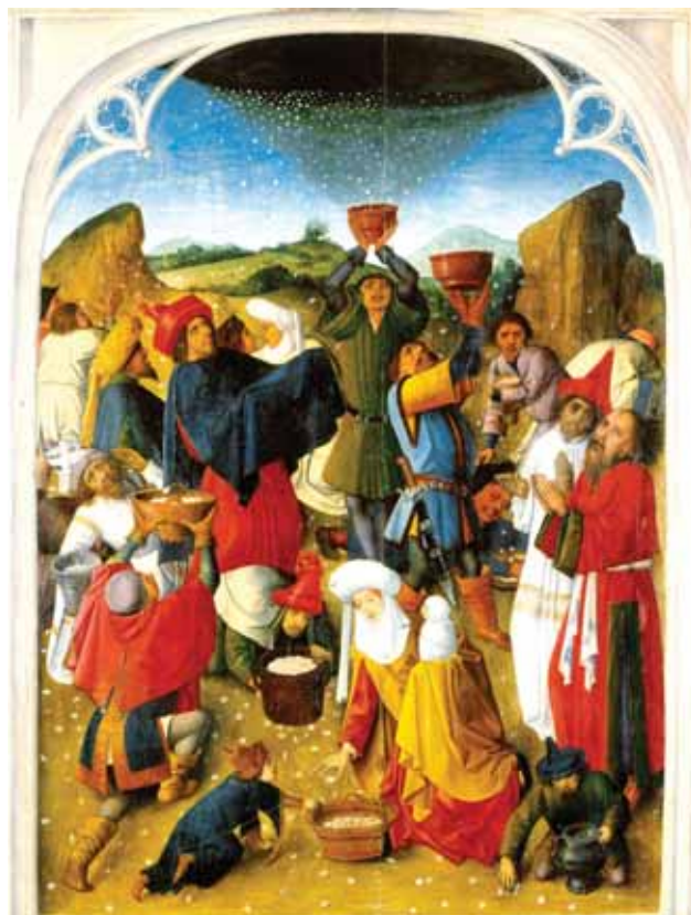
The Gathering of the Manna, c. 1460-1470.

We sit up, all senses firing, when we encounter literature that awakens us from our dogmatic slumber. The fact that the Bible contains ideas irrelevant and counter to our current culture should make students question the world around them rather than reactively challenging the text. This is the widest that we can open the young mind: to allow it