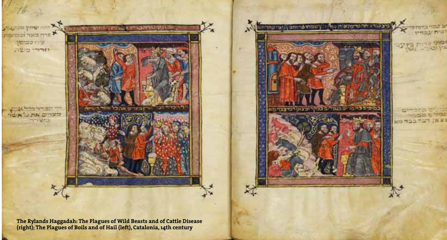
The Rylands Haggadah: The Plagues of Wild Beasts and of Cattle Disease (right); The Plagues of Boils and of Hail (left), Catalonia, 14th century

Egyptian was striking the Hebrew in an unusual manner, all of these questions are left unanswered in the text. When we turn to our canon of commentary we are confronted with both condemnation of Moshe and defense. One midrash says that for this crime Moshe was not allowed to enter Israel, while another midrash fills in the ambiguities of the text to build a clear defense of Moshe's actions.