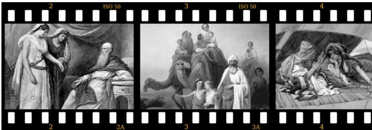
From left to right: Abraham, Sarah and Hagar (1897), Abraham's Departure (by József Molnár), Abram's Counsel to Sarai (by James Tissot, c. 1896-1902)